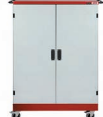
Maxi Mentor™ Holds up to 40 laptops or 80 UMPCs