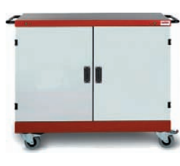
Midi Mentor™ Holds up to 20 Laptops or 40 UMPCs