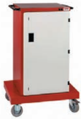
Mini Mentor™ Holds up to 15 Laptops or 30 UMPCs

The LapSafe® range offers mobile cabinets in different sizes to suit your needs. From the smallest and lowest capacity Mini Mentor™ with a small footprint, to the largest capacity Maxi Mentor™.