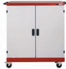
Mentor™ Holds up to 30 laptops or 60 UMPCs